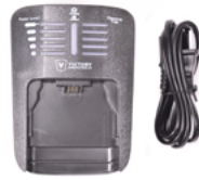
16.8 V Charger