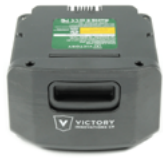
16.8 V Battery