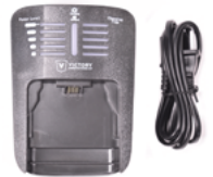
16.8 V Charger